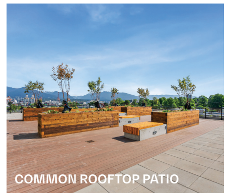
COMMON ROOFTOP PATIO