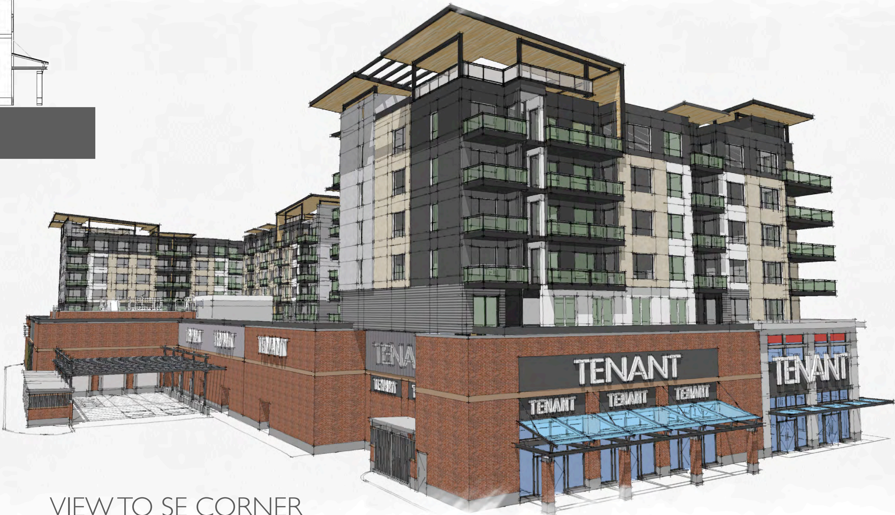
VIEW TO SE CORNER